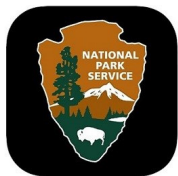
National Park Service