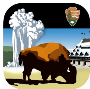
Individual Park Apps